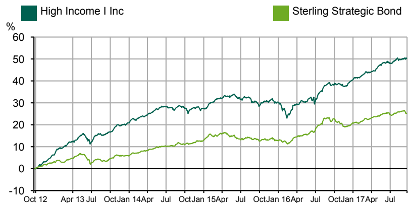
21/09/2012 - 22/09/2017 Powered by data from FE