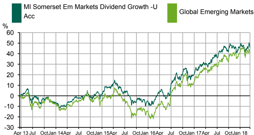
20/03/2013 - 20/03/2018 Powered by data from FE