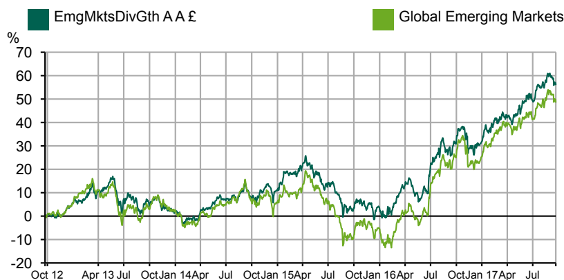
21/09/2012 - 22/09/2017 Powered by data from FE