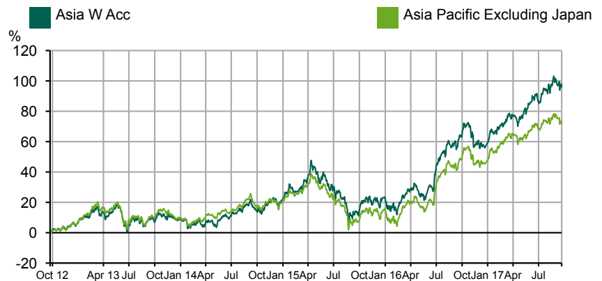
21/09/2012 - 22/09/2017 Powered by data from FE