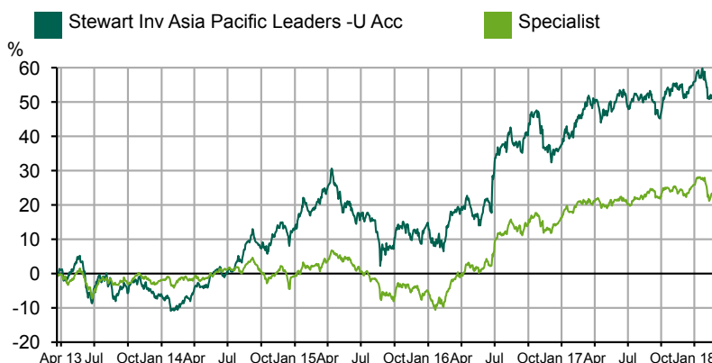
20/03/2013 - 20/03/2018 Powered by data from FE