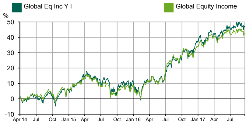
31/03/2014 - 22/09/2017 Powered by data from FE