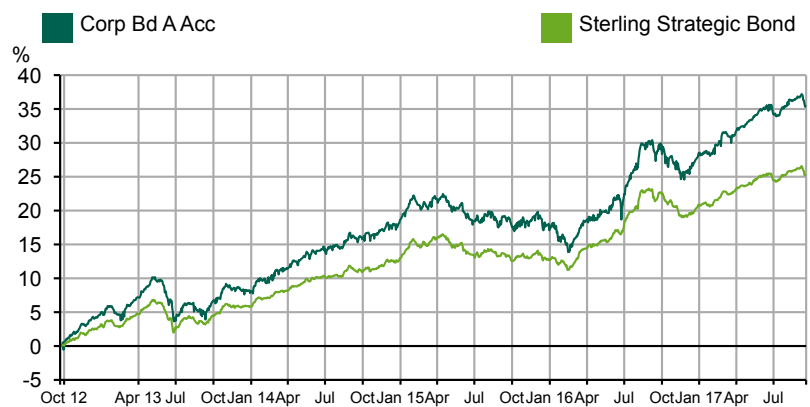
20/09/2012 - 20/09/2017 Powered by data from FE