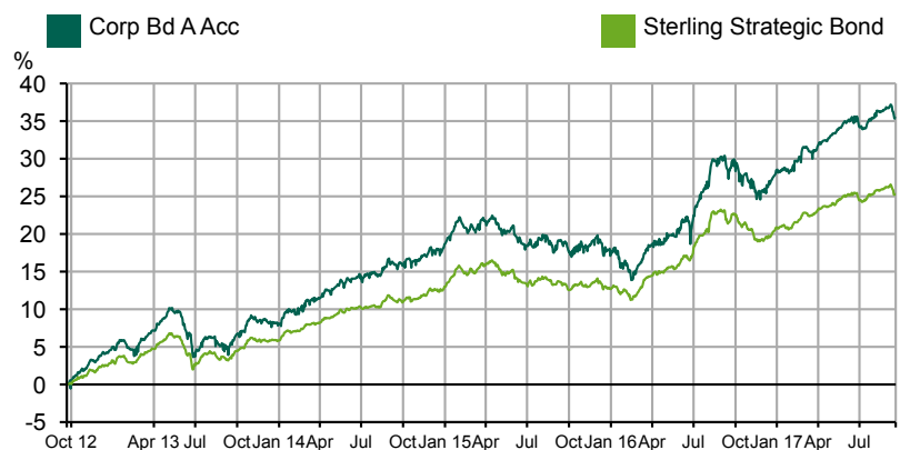
20/09/2012 - 20/09/2017 Powered by data from FE