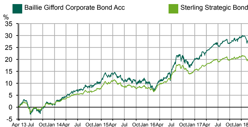
22/03/2013 - 21/03/2018 Powered by data from FE