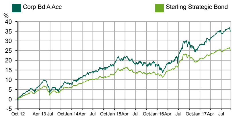
21/09/2012 - 22/09/2017 Powered by data from FE